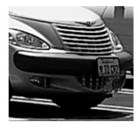
Figure 4. Left image: anti-aliasing & sharpening disabled; Right image: anti-aliasing and sharpening enabled