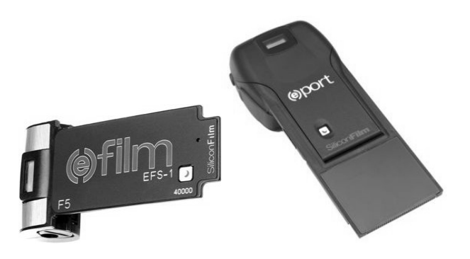
Figure 1. EFS-1 components: (e)film and (e)port

In addition, the functional requirements of minimal impact and interference with camera operation implies that the (e)film cartridge should operate from a dedicated power source rather than use the batteries of the 35mm camera body. The (e)film power, therefore, is supplied by a pair of 1/3N batteries stacked within the film canister. The 1/3N batteries are the smallest size batteries readily available and consistent with the (e)film power requirements. Even these small form factor batteries occupy most of the available volume in the film canister section. As a result, the circuit board containing the electronic components necessary for image capture, storage, processing and control are contained on a rigid/flex PCB assembly that is wrapped and folded around the (e)film battery compartment and represents some fairly creative circuit board design and layout as well as clever mechanical engineering of the (e)film cartridge. A functional block diagram of the EFS (e)film/(e)port is shown in Figure 2.